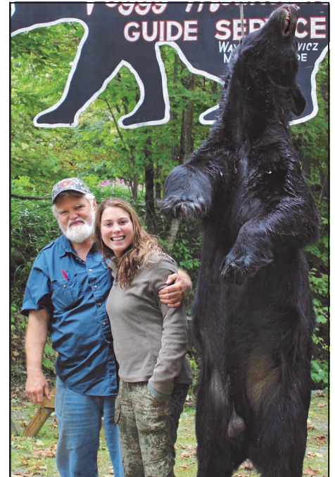
A Bear Hunt as a Graduation Gift? She asked for it! She got it! See page 2