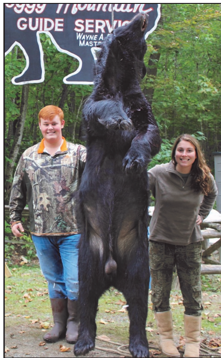
A last minute invitation from his generous and charming friend was just the beginning of his good luck!