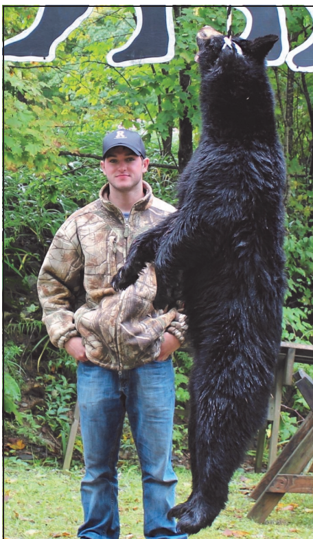
Nice "Maine Highlands" Bear