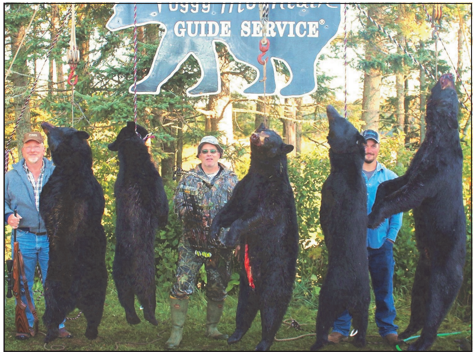
As these two photos show, the last of the bear season can be extremely productive