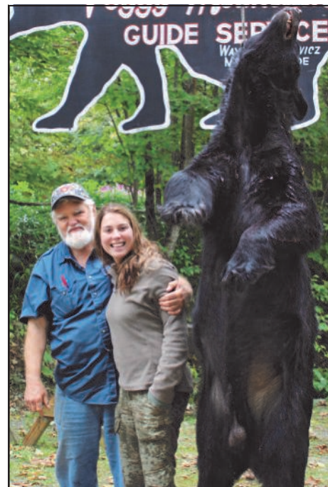
A Bear Hunt as a Graduation Gift? She asked for it! She got it! See page 2