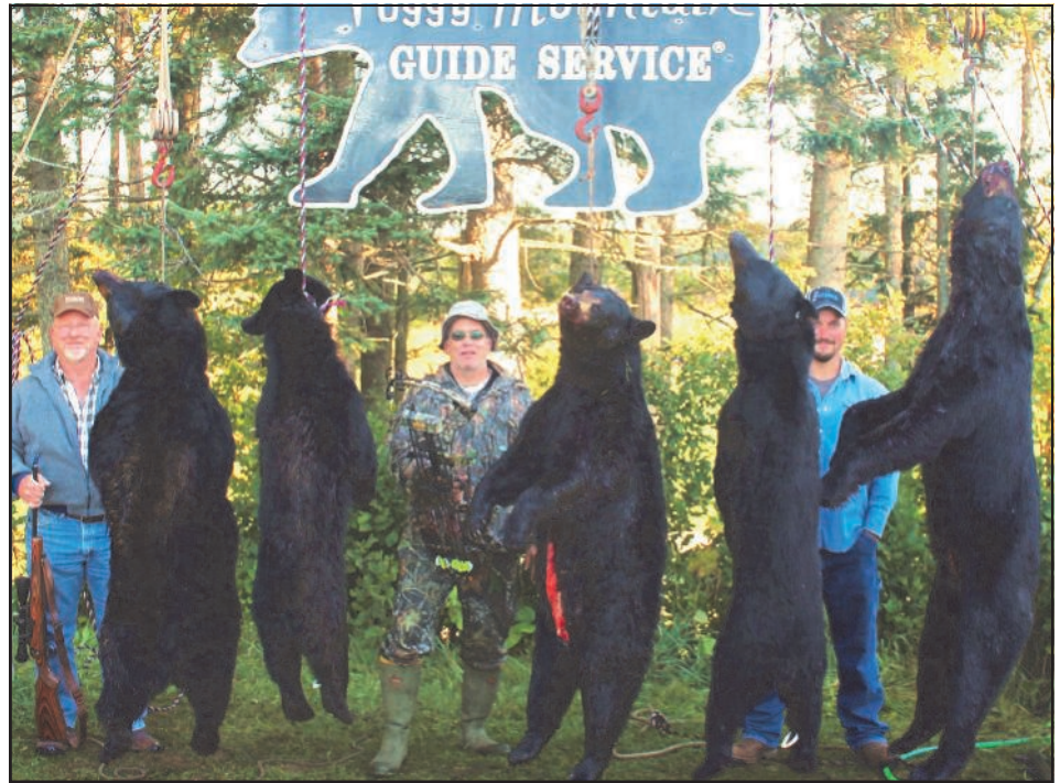
As these two photos show, the last of the bear season can be extremely productive