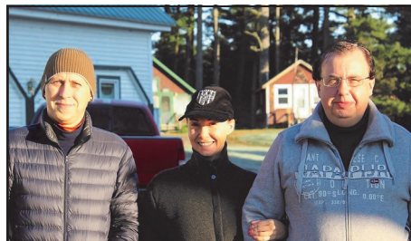
Our Bear Hunting Friends from Russia