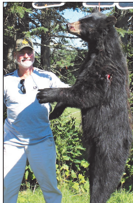
Nice Maine Bear

We are Proud to be a Member of our Industry's Supporting Organizations