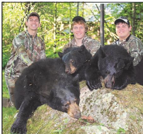
One Family, One Day, Three Bears

"I can't tell you how happy I am with this year's hunt – and not because I got a great bear. Everything was just great: the weather, the other hunters and the hunting. It's going to be a long year until I get back. I can't wait. It's always the high point of my year."