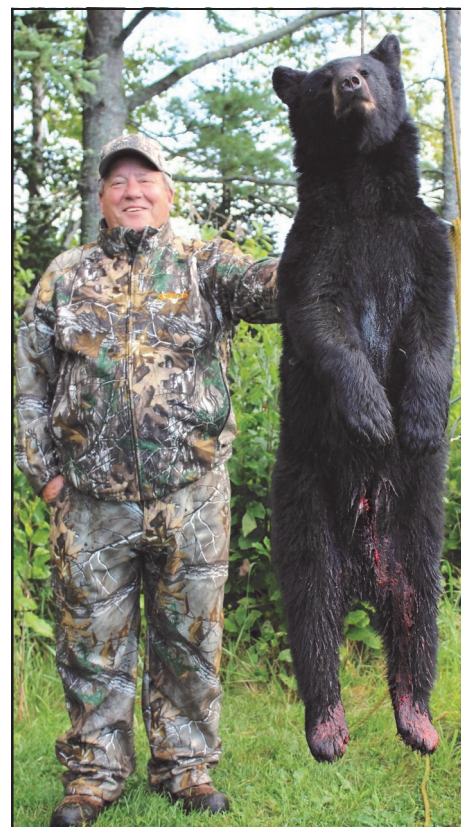
Very Nice Northwoods Maine Bear