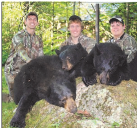
One Family, One Day, Three Bears

"I can't tell you how happy I am with this year's hunt – and not because I got a great bear. Everything was just great: the weather, the other hunters and the hunting. It's going to be a long year until I get back. I can't wait. It's always the high point of my year."