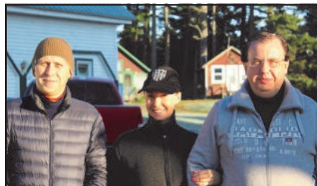
Our Bear Hunting Friends from Russia