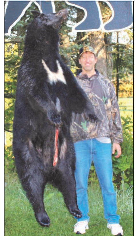
Beautiful North Woods Black Bear