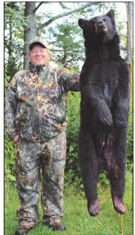
Very Nice Northwoods Maine Bear