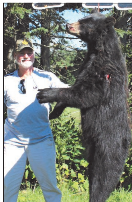
Nice Maine Bear