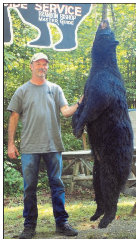
Paul Suplinskas' Maine Highlands Black Bear