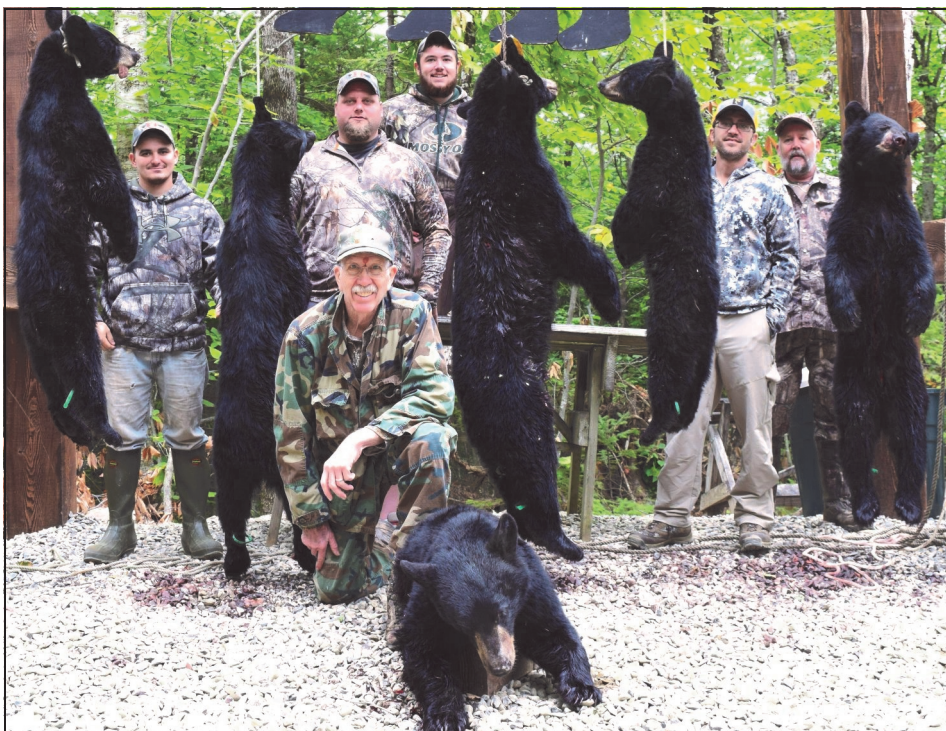
It was a busy night for these Highlands region Hunters