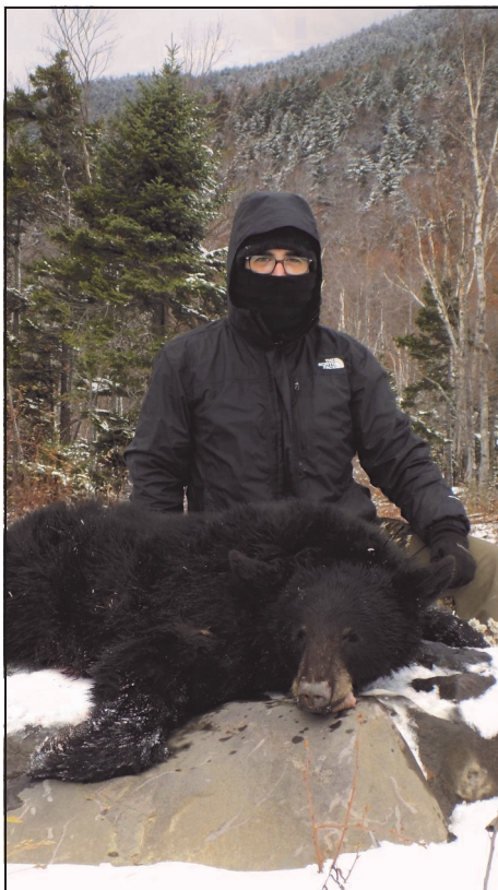
Trophy Black Bear taken with hounds during an early Maine snowfall