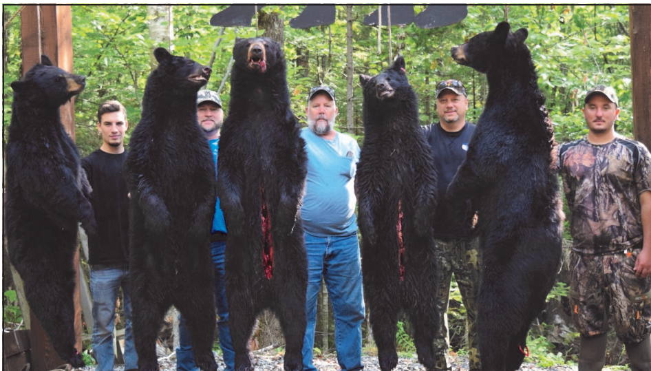
It was a busy night for these Highlands region Hunters