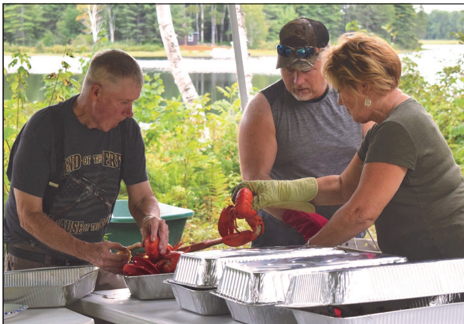
Starting the week with Lobster by the lake