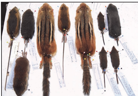
Al captured some nice small mammal trophies this year