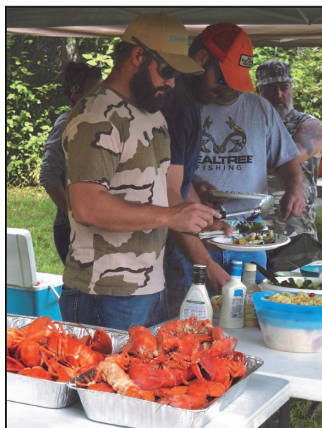
Welcome to Foggy Mountain for some fresh Maine Lobsters, grilled steaks and corn on the cob!