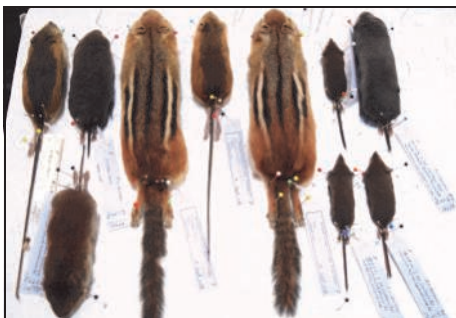
Al captured some nice small mammal trophies this year