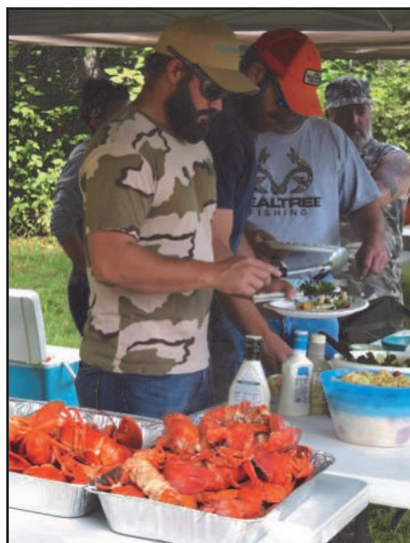
Welcome to Foggy Mountain for some fresh Maine Lobsters, grilled steaks and corn on the cob!