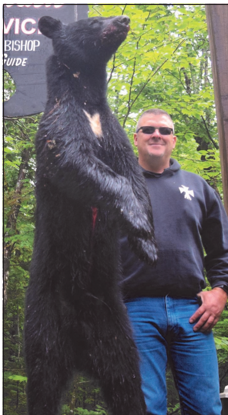
Monster