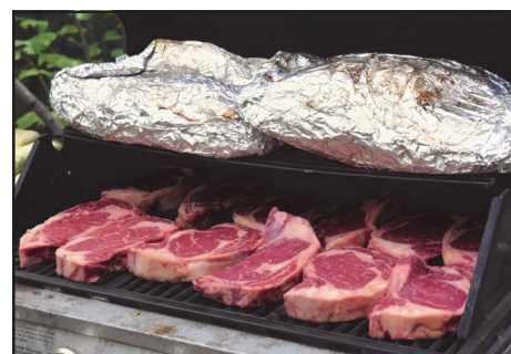
Surf & Turf day at Foggy Mountain

We are always working towards next year to make sure each year is as successful as the last. We love what we do. Your success is our success. 🐾