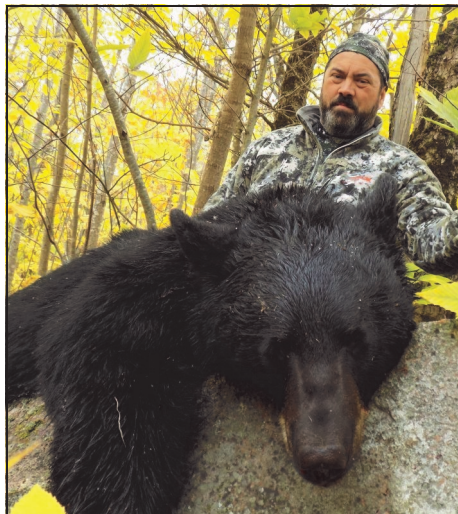
Trophy Black Bear taken over hounds

Our hounds have the experience and heart to get the job done, and done right. These hounds, alongside a truly skilled houndsman, will make for an experience you will never forget.