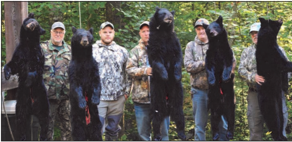
Lots of happy hunters!