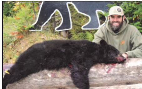
The smile says it all!