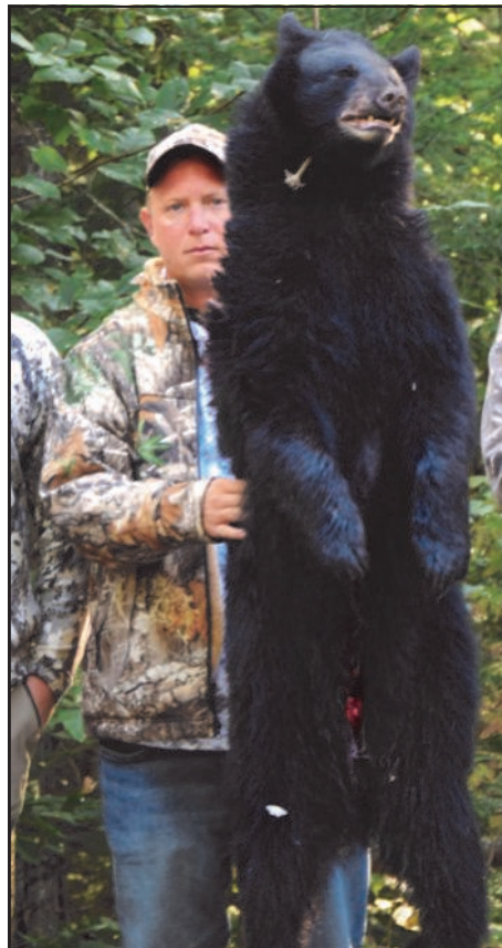
Another Great Bear on the Pole

Moose Hunts Applying for a moose permit? Our preference Zones are 8 and 4