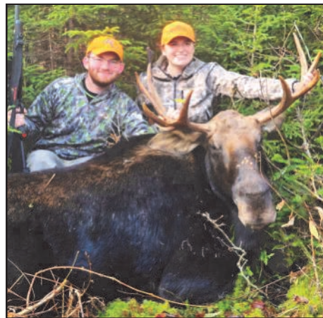
Zone 8 Bull Moose