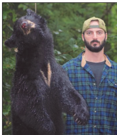
Perfect white "V" on this nice bear